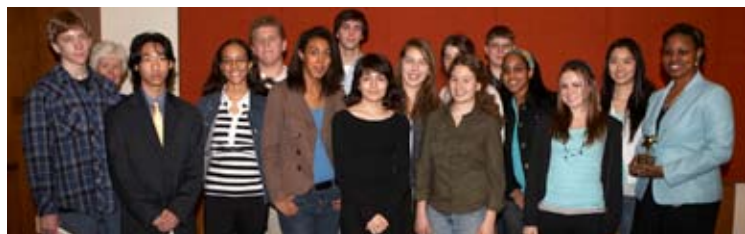
Richard Montgomery High School

on March 20, 2007. Richard Montgomery High School won first place and second place was awarded to Montgomery Blair High School. Winning PSA's are airing on Access Montgomery Channel 21 on Tuesday evenings and Thursday afternoons in our educational subject block. Be sure to watch.